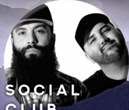
SOCIAL CLUB MISFITS